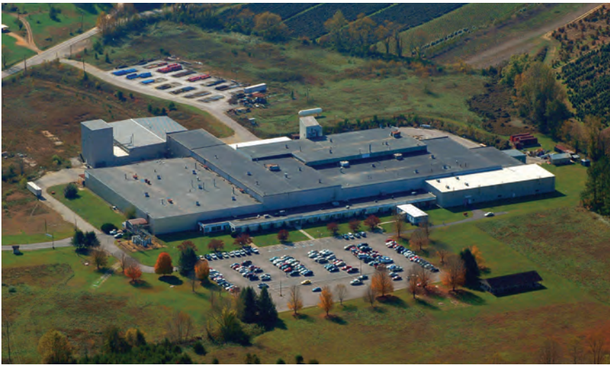
Resistoflex - Marion, North Carolina