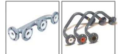
Resistoflex Lined Pipe & Fittings Provides excellent corrosion resistance Custom shapes, branches, and bends to reduce potential leak points