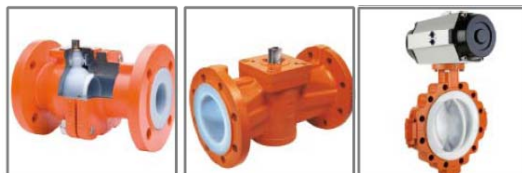
XOMOX Lined Valve Products Fully lined plug, ball, and butterfly valves have coatings that extend over shafts to prevent corrosion. Ball check and swing check valves are available for spec break applications (transition from lined to metallic pipe)