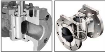
XOMOX Sleeved Plug Valve Alloy 20 available for >96% H 2 SO 4 Available with heating jacket for molten sulfur applications