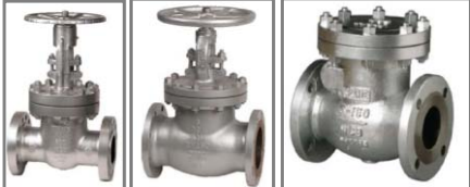
CRANE Energy Products CRANE Energy's wide range of products for utility lines complements CRANE ChemPharma's offerings within chemical processing plants