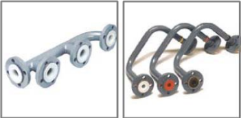
Resistoflex Lined Pipe & Fittings Provides excellent corrosion resistance Custom shapes, branches, and bends to reduce potential leak points