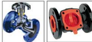
Saunders Lined Diaphragm Valves Fully lined to protect against corrosion Diaphragm seals around solids (tight shutoff)