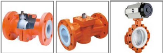
XOMOX Lined Valve Products Fully lined plug, ball, and butterfly valves have coatings that extend over shafts to prevent corrosion. Lined accessories also available: strainers, check valves, sight glasses