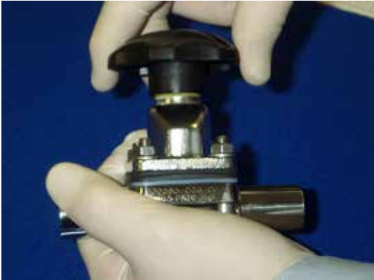
Moulded Closed 214S/425