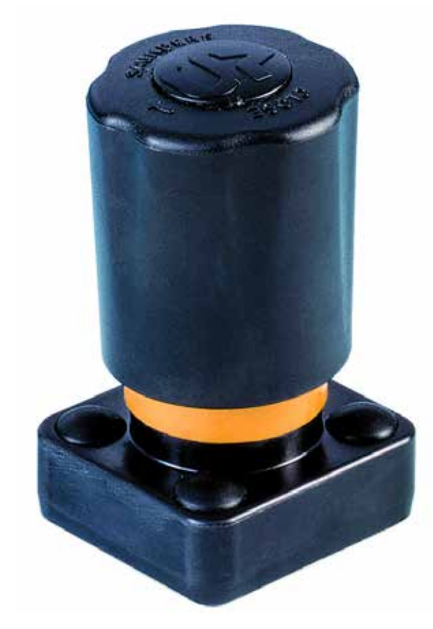
Optional stainless steel base available upon request.